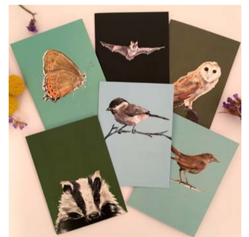
Holly Burrows - HS2Animals_setof6