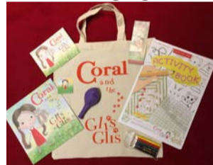
'Goody bag' for first 20 Samways sales