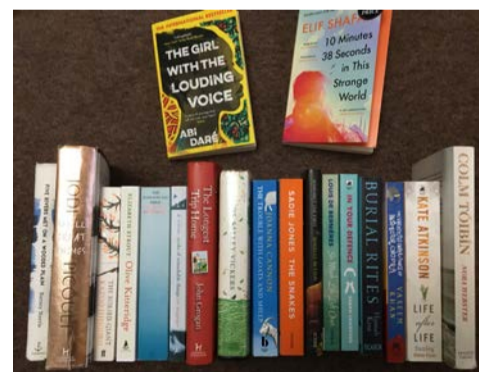
Some of the books read by Prestwood book club

Prestwood book group has been running successfully in the local area since 2013 and still has some of its original members.