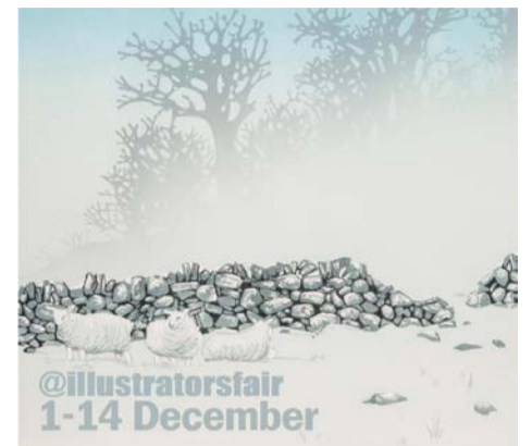
Flyer by @laura_boswell_printmaker (local artist)

The fair showcases work by illustrators based locally, nationally and internationally and runs from the 1 - 14 December so you'll need to be quick! Search 'Illustrators Fair' on Instagram and Facebook for your unique, fresh and last-minute illustrated Christmas gifts and cards. It's also a great platform for retailers to search for new suppliers to make